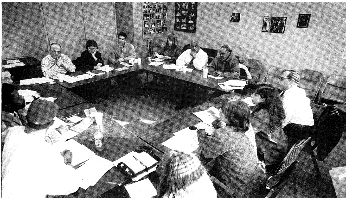
The Working Group on HealthChoices and HIV (pictured here) is made up of over 50 AIDS service organizations and consumers living with HIV who advocate for better health care for people with HIV who are enrolled in Medicaid managed care. The group, convened by the AIDS Law Project and Philadelphia FIGHT, meets monthly to share concerns and develop strategies for systemic reform. If you would like to get involved in the Working Group on HealthChoices and HIV, please call the Law Project at 215.587.9377.

Both seminars are two hours long, provide time for questions and take place at the Law Project office, 1211 Chestnut Street, Suite 1200. For a seminar schedule, call the AIDS Law Project at 215.587.9377 . There is no fee to attend.