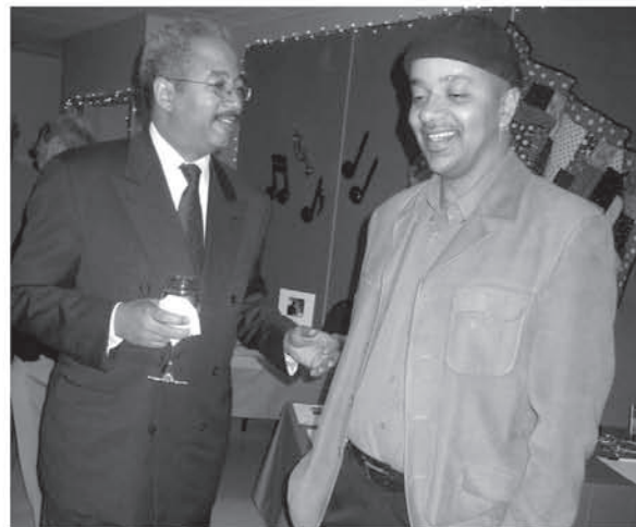
U.S. Rep. and Philadelphia mayoral candidate Chaka Fattah (left) trades a chuckle with James McBride before the concert.