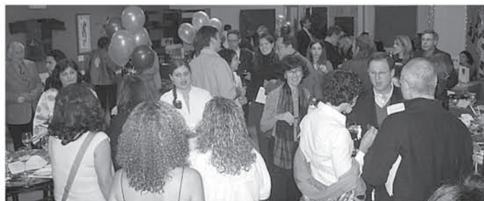
The silent auction room on the fourth floor of the Clef Club filled with animated patrons who perused dozens of auction items from neckties to a French vacation house.