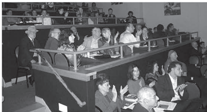
The audience in the front tiers of tables applauds a vigorous performance by James McBride and his band at the Philadelphia Clef Club of Jazz & Performing Arts.