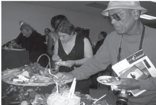
Those attending the silent auction enjoyed a sumptuous spread of finger foods, including cheeses, vegetables, fruit and shrimp.