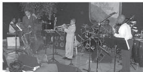
The Young Talents of West Philadelphia launched the evening's entertainment as the warm-up act for James McBride and his band. McBride praised the ensemble and the value of young people getting involved in music and the arts.