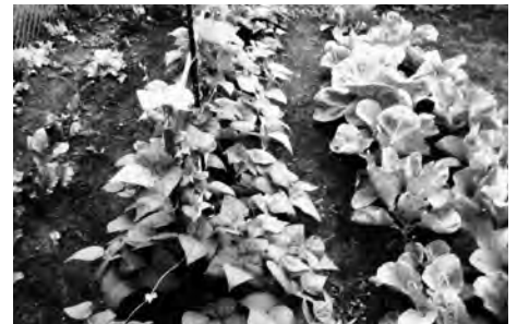
The AIDS Law Project saved the house – and garden – of a Pennsylvania man who was heading for foreclosure. See the full story on page 3.

The staff of the AIDS Law Project of Pennsylvania will remain vigilant to ensure that Pennsylvanians are aware of their right to give consent to be HIV-tested.