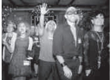
SEE PHOTOS OF ALL OF THE FUN ON PAGES 4 AND 5.